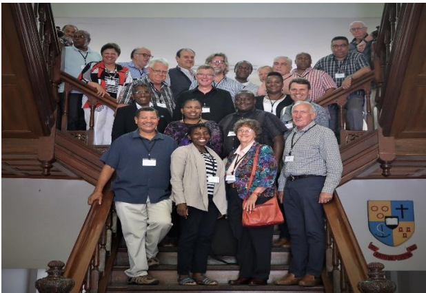
Delegates at the TEASA Colloquium

On the 23/24 January, the TEASA Theological Commission convened a colloquium at the Stellenbosch University Faculty of Theology. The aim was to explore the Evangelical roots of the Reformation so as to better understand the connectedness of the Evangelical movement to it. The proceedings were accompanied by lively discussions on what it means for evangelicals today and tomorrow. A report is currently being completed and will be available on the TEASA website soon.